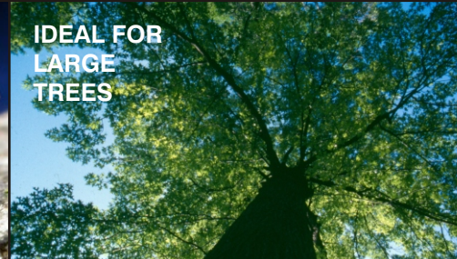
IDEAL FOR LARGE TREES