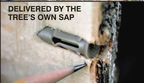
DELIVERED BY THE TREE'S OWN SAP